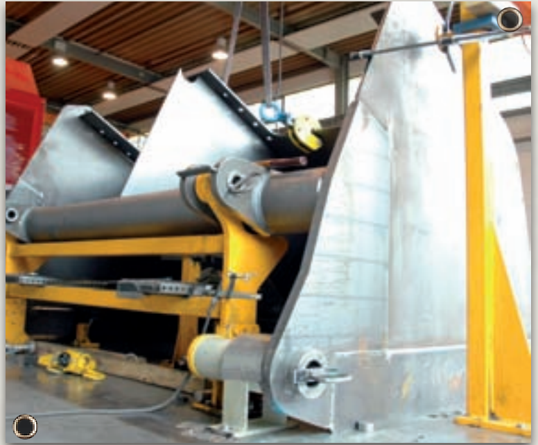
Manufacturing of grab scoops with a size of 12m 3 in a welding jig

Regular testing and certifying of our company as well as ongoing qualifications of our employees ensure the high quality of our manufacturing process.