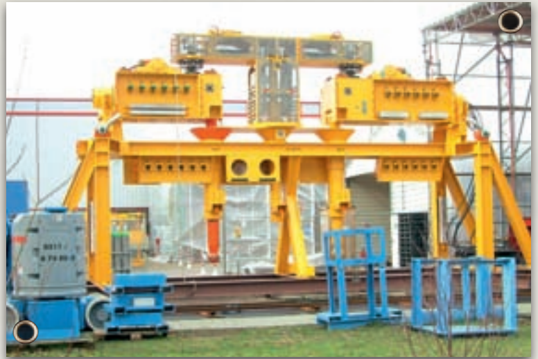
Working test of a subsea distribution station, used in a depth of up to 2,500 m

Our customers have high quality requirements and are often international acting companies: Cameron, SMAG, Jensen, Renk and Weatherford and many more use our products world wide.