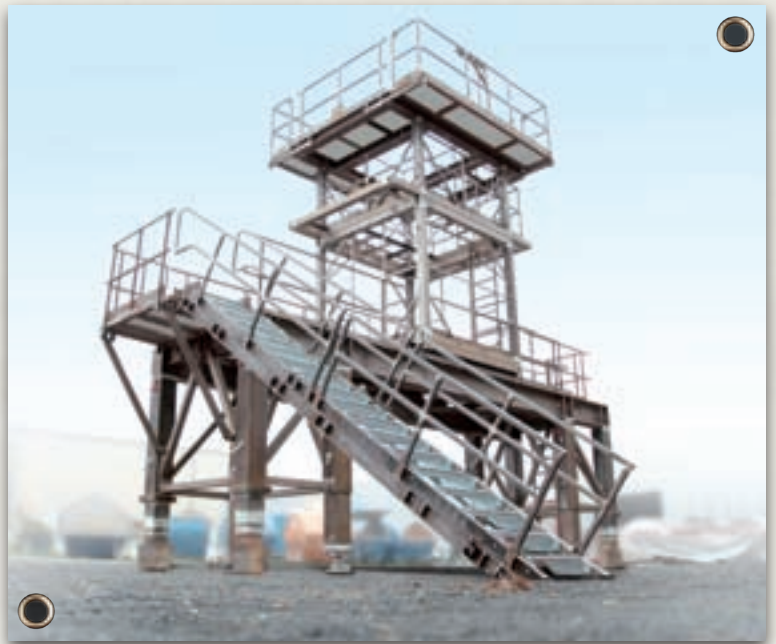
Adjustable coil tubing frame for use in Ex-Zone 1