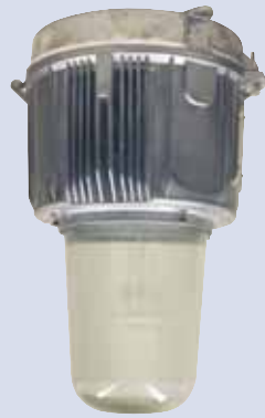
The Centuria with external reflector