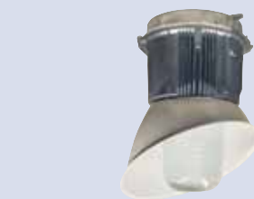
The Centuria with angle reflector

The Centuria embodies the philosophy of low maintenance design. Easy access is gained to the enclosure via a single bolt ensuring quick maintenance to the lamp housing and control gear reduces installation time and overall lifetime cost. Centuria also features no exposed flamepath removing the need for additional inspection and maintenance.