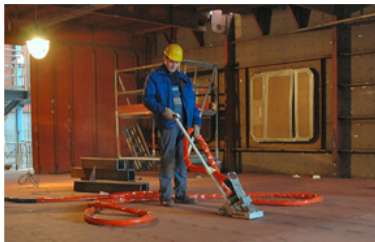
Clean, safe, comfortable. Induction fairing drastically improves the quality and the working environment. Nitrous gases, for example, are radically reduced.

With traditional straightening (or 'fairing'), an operator heats the metal plate with a gas flame. As the area cools the heated side contracts more