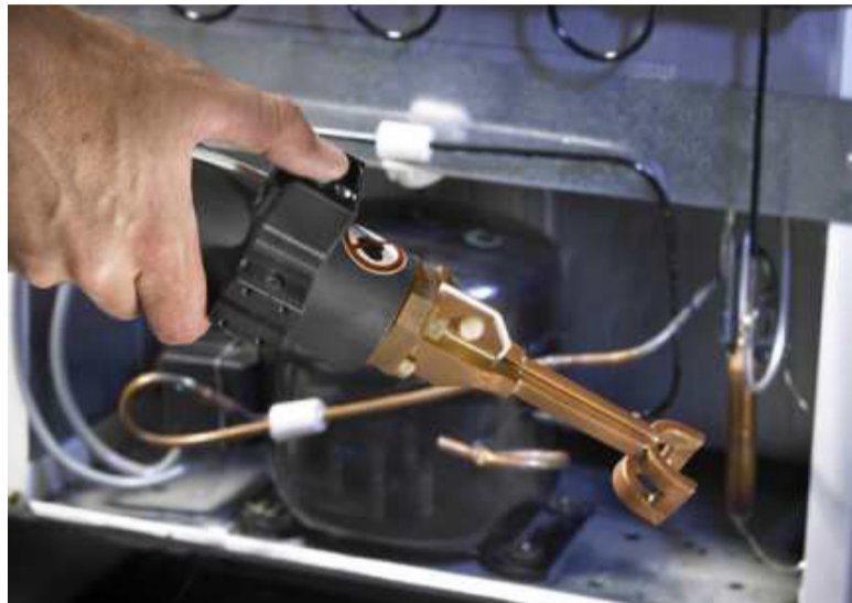
The right heat just where it's needed. A hand-held transformer fitted with a customized coil makes it easy for the operator to deliver the benefits of fast, clean, accurate induction brazing.

EFD Induction equipment is used at some of the world's largest consumer refrigerator manufacturing facilities as a superior alternative to traditional flame brazing of tubing connections, as well as for heating pre-painted panels prior to bending. Tom Brown of EFD Induction USA explains more about this safer, more consistent, repeatable method of heating.