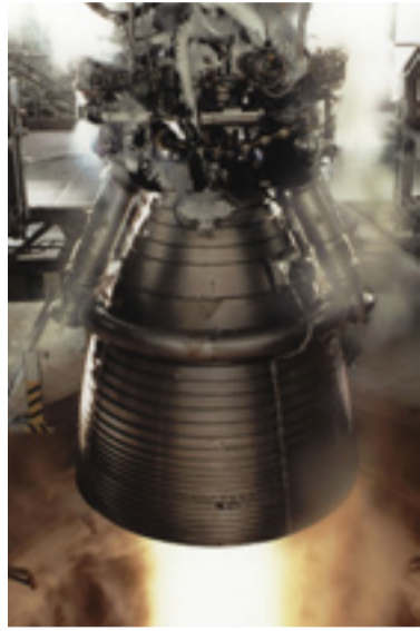
Vulcain engines are used on the European Space Agency's Ariane 5 rockets. The lightweight engine cone is made from graphite produced used induction heating.

Specialized applications. Stringent quality levels. Tight leadtimes. The global aerospace industry sets tough demands on its parts and equipment suppliers. But they are the kind of demands that induction technology is uniquely qualified to satisfy.