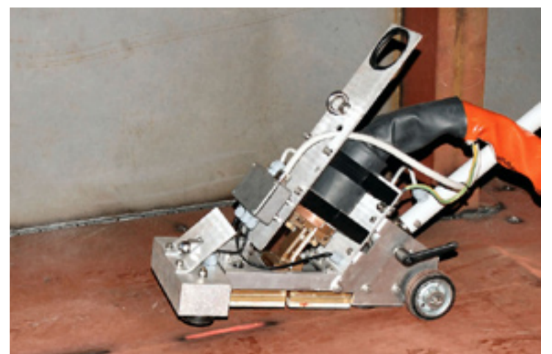
Induction heating is controllable. The result is faster, better quality fairing than that achieved by open flames.

the traditional process is taken into account. Moreover, samples sent to an independent laboratory showed an improvement in the metallurgical properties of the steel after heating with induction compared to flame.