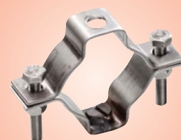
SPOL4-100004 (38-42mm dia) SPOL4-100005 (48-52mm dia) SPOL4-100006 (58-62mm dia)