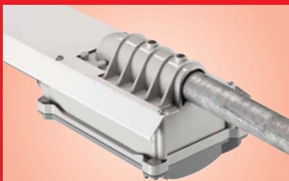
Suffix /SE (Spigot Entry)