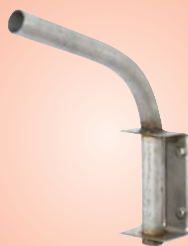
NPRO4-0007 (for use with /SE version) NPRO4-0008 (for std. 18W version) NPRO4-0012 (for std. 36W version)